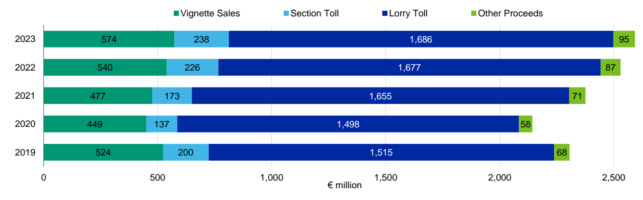
Exhibit 3 ASFINAG's revenue in 2023 was the highest in the past 10 years

In 2023, with a 2% increase from the year prior, ASFINAG continues to record their highest revenue collection reaching a total of €2,593 million (see Exhibit 3). Traffic levels and revenue in 2024 are likely to be relatively unchanged to those in 2023. In 2024, as a one-off measure also to address rising cost for consumers, the indexation of some tariffs will not be taking place. We see this as manageable for the company.